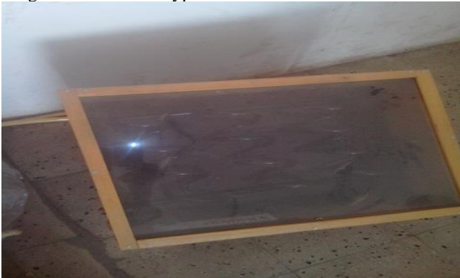
Fig 1 Helical Solar Water Heater

A helical type flat-plate solar collector is basically a black surface which is called collector that is placed at a convenient angle to the daily motion of the sun for collecting maximum solar radiation, and provided with a transparent cover for trapping the heat; appropriate insulation for reducing heat losses around the sides, top and rear can quite effectively act as an energy converter. Water is used as heat transfer fluid which moves through the tubes due to density gradient caused by temperature differences. In this experiment, a helical type thermo syphon flat-plate solar water heater has been constructed and fabricated. It has a helical collector coated with ordinary black coating. This system is a passive natural circulation heating system or non-pump system which works using heat transfer technique, designed on a thermo syphon mechanism.