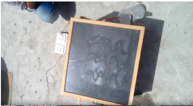
Fig 2 Experimental Set up