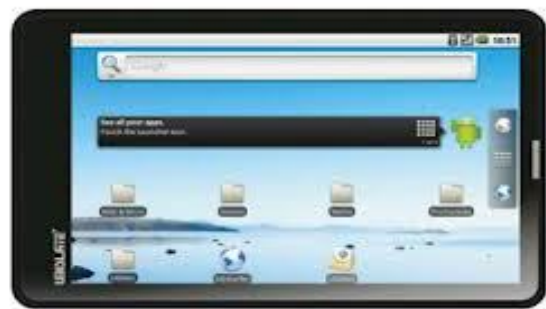
Fig : AKSHA computing device

Aksha is a world low cost computing cum access device for students use in virtual education through NME-ICT lunched MHRD.