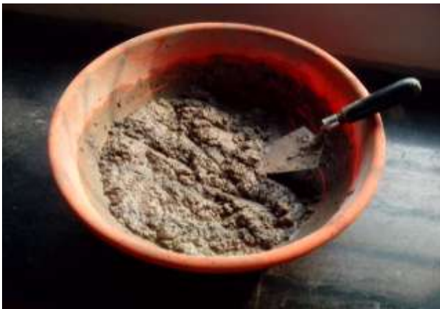
Image No.1 Fresh mix Mortar

Sample 1) fresh mortar or traditional cube. Sample 2) 50% volume of cube cast in fresh mortar and reaming cube cast after 1 hours with joint cement slurry. Sample 3) cube cast after 1 hour fresh mortar.