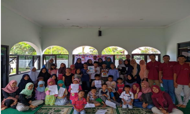
Fig. 4.2019 Ramadhan Festival

The Mubaligh Hijrah Community Service Program in collaboration with the Raudhatul Jannah Mosque Teenagers of Dusun Pojok held the 2019 Ramadhan Festival Contest which took place on Sunday, May 26, 2019 at the Raudhatul Jannah Mosque in show picture 4. This activity was attended by approximately 40 participants, the majority of them was kindergarten, TPA and Junior High School students of Dusun Pojok and surrounding areas.