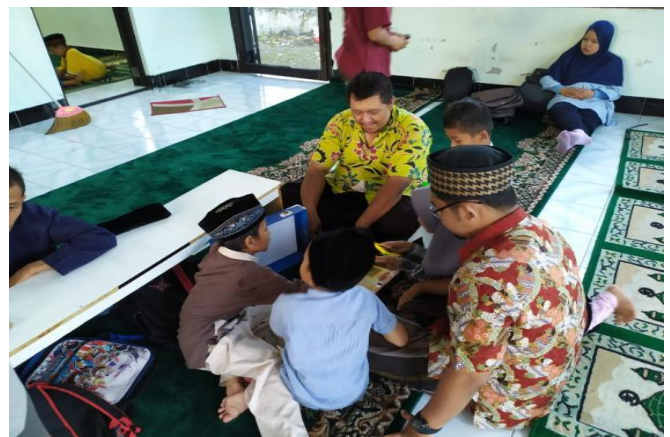
Fig. 3. Introduction to Robotic Technology

Today's society thinks that a robot is shaped like humans both functions and ways of acting in show picture 3. The benefits of robotic learning is to train the child's fine motor skills so as to improve fine motor skills and stimulate systematic and structured thinking in solving a problem. It also develops children's imagination and creativity in designing a robot, practices collaboration in groups, increases self-confidence, accepts and respects the opinions of others and dare to unite or display creative ideas, and practices patience and perseverance in making a project.