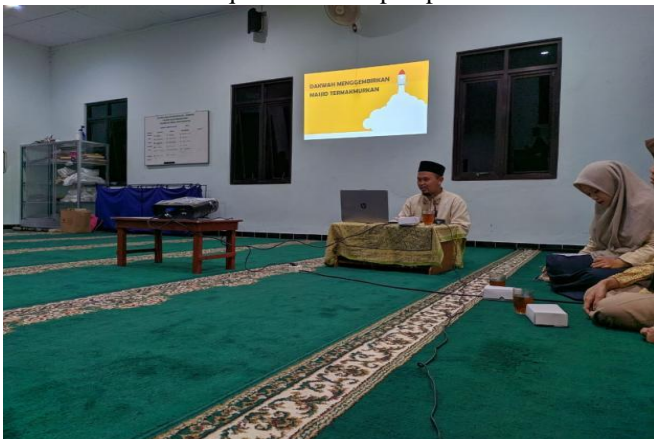
Fig. 2. Mosque Management Education

Management means the art of organizing and implementing in show picture 2. Management is also defined as an effort to plan, coordinate, organize and control resources to achieve goals efficiently and effectively. Effective means to achieve goals according to the plan and efficient means to carry out work properly and organized. So, mosque management is planning, coordinating, organizing, and controlling the resources of the mosque to make it prosperous.