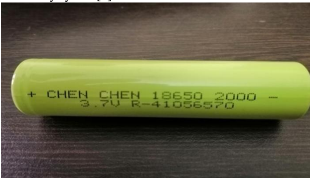
Figure 3: Li-ion cell 3.7V and 2Ah

Battery: Batter is electrochemical device which is used to store electrical energy in the form of chemical and release the electrical energy back when required. The battery installed in system for storing the generated electricity which is not consumed by user or stored for later use[6]. The batteries used in this project are lithium ion battery pack, in which each cell is connected in series and parallel configuration with each other (13s30p). Each cell of pack is of 3.7 volt and 2Ah energy density for storage, it makes the pack of capacity of 2.8KWh for storing electrical power generated by system[7].