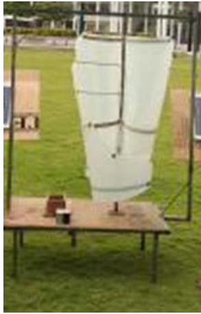
Figure 7: Roadside Wind turbine prototype