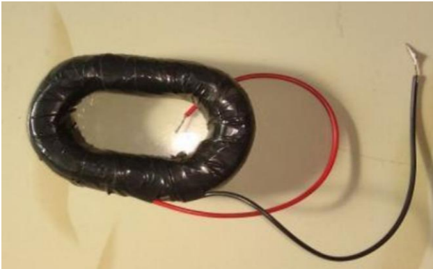
Figure 2: Coil

Battery: Batter is electrochemical device which is used to store electrical energy in the form of chemical and release the electrical energy back when required. The battery installed in system for storing the generated electricity which is not consumed by user or stored for later use[6]. The batteries used in this project are lithium ion battery pack, in which each cell is connected in series and parallel configuration with each other (13s30p). Each cell of pack is of 3.7 volt and 2Ah energy density for storage, it makes the pack of capacity of 2.8KWh for storing electrical power generated by system[7].