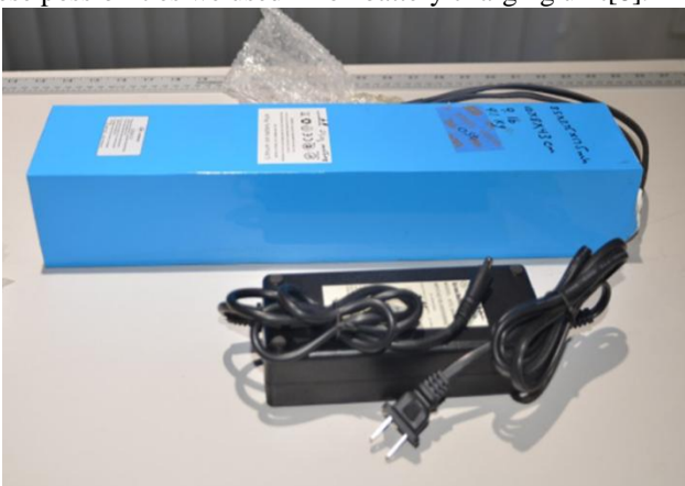
Figure 4: Li-ion Battery pack charging unit

Li-ion Battery Charger: A li-ion battery charging unit is installed in system for proper charging of li ion cell for safety purpose and increasing the life of battery pack. The li-ion cell are cells are highly unstable if not handled properly it includes its charging. The cell is over charged for a long time it have high chances of catching fire. So, for removing these possibilities we used li-ion battery charging unit[8].