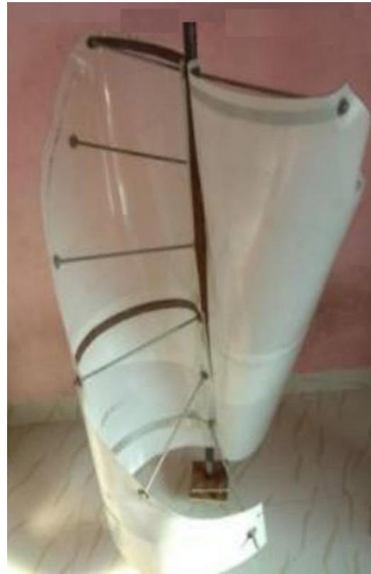
Figure 1: Vertical Axis Wind Turbine

Vertical Axis Wind Turbine: The vertical axis wind turbine is designed for harnessing maximum power, the wind turbine converts the kinetic energy into mechanical energy for generating the rotational motion. The wind turbine designed specification are shown in below given table: