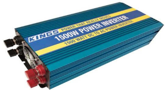
Figure 5: 1500Watt inverter

Inverter: An inverter is a device which is used for converting direct current into alternating current. In this project we implemented an inverter for converting 48V DC power into 220V, 50Hz AC for supplying power to household loads, street light and many other electrical loads up-to 1500Watt[9].