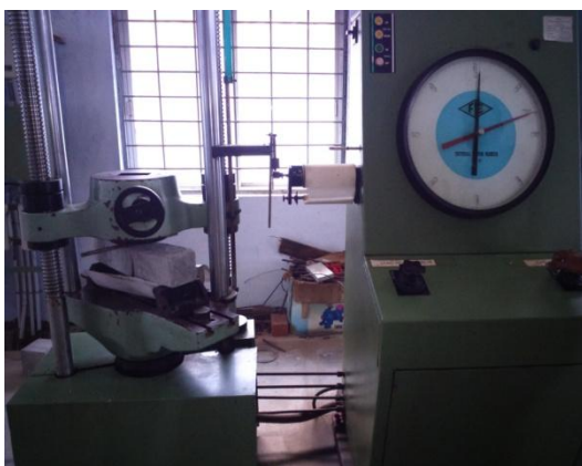
Fig. 5 Universal Testing Machine

The flexural strength of different fibre ratios are compared with conventional concrete. Eighteen concrete beams (500x100x100mm) were tested in flexure (ASTM C7875) after 7 and 28 days. For plain concrete beams, cracking immediately leads to failure. Utilization of fiber delivers all the more firmly dispersed breaks and reduces crack width. Here are the test results for 7 and 28 days.