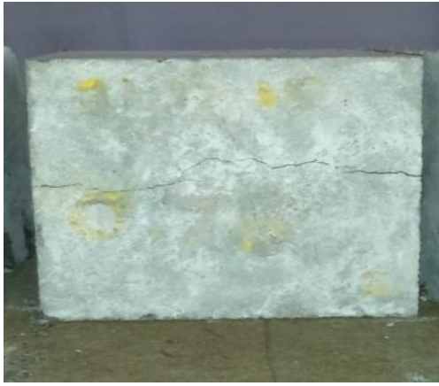
Fig. 8 Cube failure in M35 fibre concrete