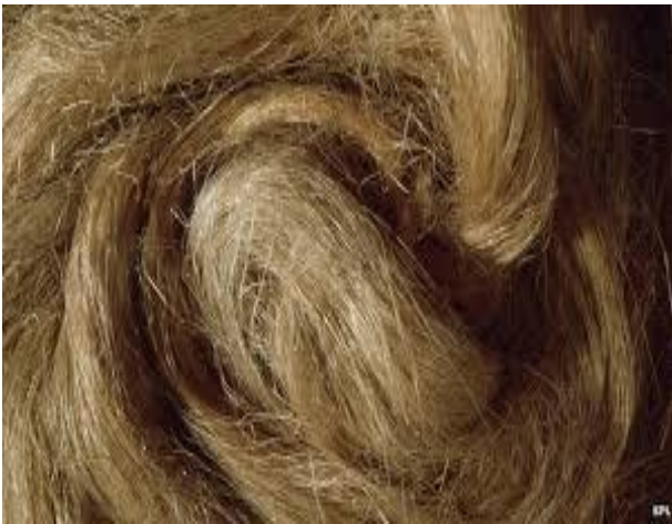
Fig. 1 Hemp fibre