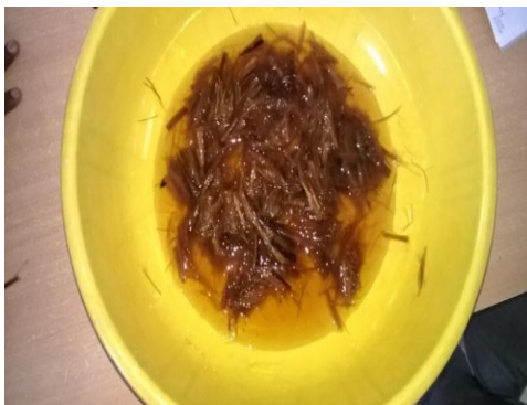
Fig. 2 Fibre Treatment

Hemp fibres were treated with 5% weight of NaOH solution. Fibres were soaked in the NaOH solution for 24 hours at 50°C, followed by wash with running distilled water until the pH value ranged from 6.8 to 7.2. Then the fibres were dried in the oven at 80°C for 10 hours.