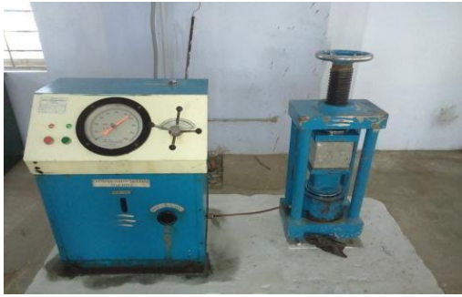
Fig. 3 Compressive Testing Machine