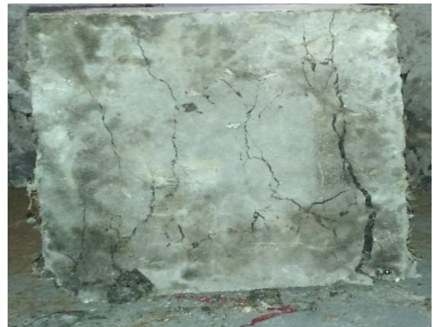
Fig. 7 Cube failure in M35 plain concrete

While stacking, since the plain concrete is weak, it has appeared sudden and fragile disappointment.