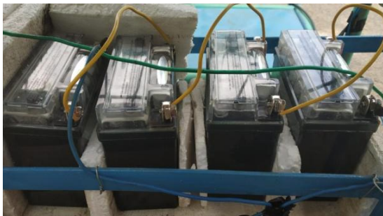
Fig.3. Li-ion Batteries in E-Vehicle

Power Supply Element is the key and vital element in this Vehicle. This Power Supply Element consists of battery, Plug in and Plug out cables, etc., The battery is important part in the Power Supply System and it should ensure that battery storage capacity is double the power that required in day time. Here the battery supplies voltage of about 48V. The battery used is lithium ion battery and each cell is of 12V capacity.