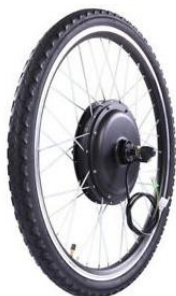
Fig.4. Hub Motor

E-Vehicle consists of three wheels, one wheel at front and two wheels at rear. The rear wheel is hub motor. This hub motor is connected to the battery by means of throttle and the controller. Throttle is used to adjust the speed of the hub motor. Supporting wheels can fixed which provides furthermore mechanical strength of the E-Vehicle.