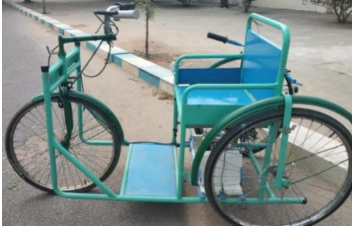
Fig.2. Chassis of the E-Vehicle

Finally the front wheel is mounted with the steering set up and the wheels which has motor (hub motor) in it is also mounted at the rear part of the vehicle. The hub motor is connected with the battery. The chassis is fixed with front and rear lights, speedometer, indicating lights, horn, etc.