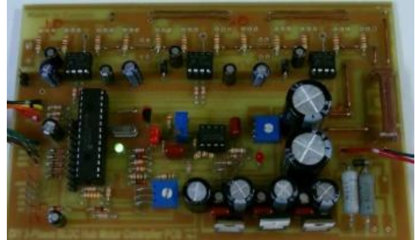
Fig.5. Control Circuit

The operation of E-Vehicle is controlled by the controller. The Vehicle control is done by electrical units. The control functions includes throttle control, braking, lighting, etc.,