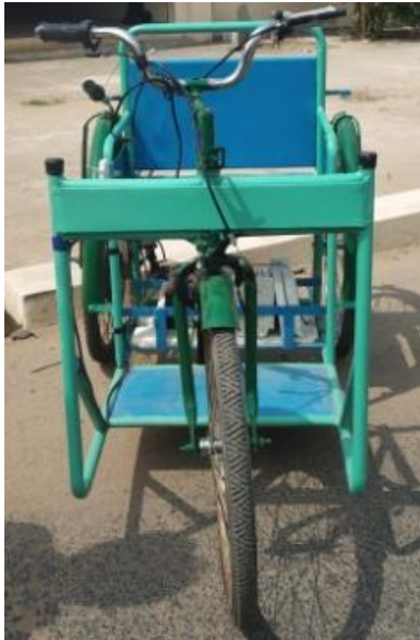
Fig.6. Proposed E-Vehicle