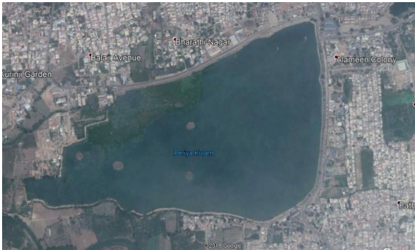
Fig 1. Study area – Ukkadam lake

for the development of the lake. In 2013, the de-silting was carried out by the Coimbatore Corporation in association with NGO Siruthuli, Residents Awareness Association of Coimbatore and Vijayalakshmi Charitable Trust. The restoration of the lake was funded partly by the government and partly by private corporations and the activity was carried out with the help of volunteers from public.