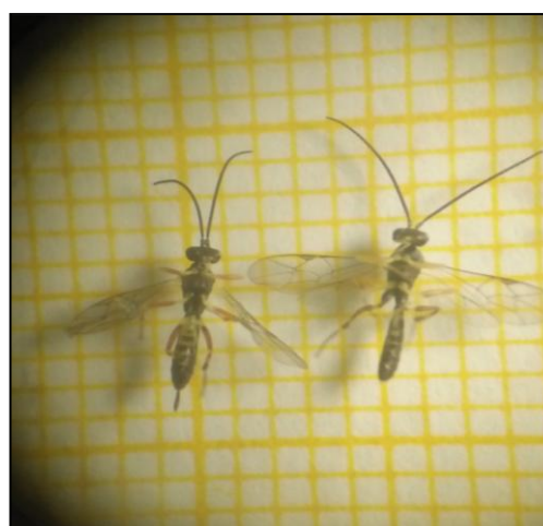
Fig. 2 Imago D. semiclausum : a) Female Imago, b) Male Imago

Descendants of parasitoid D. semiclausum appearing from P. xylostella parasitized larvae tend to be male imago then female imago. In EC control treatment, 2 \times LC_{95} EC and 2 \times LC_{95} WP has the same ratio of males and females there were 3:2 whereas in WP control has a comparison of males and females 2: 1. The imago form of male and female D. semiclausum can be seen in Figure 2.