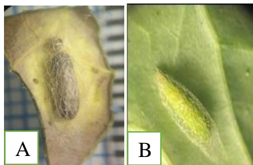
Fig. 1 The shape of the pupae: a) parasitized pupae, b) healthy pupae

An average number of parasitized pupae in control EC was 28.00 tails and the number of parasitized pupae in EC formulation treatment was 26.50 tails while the number of parasitized pupae in control WP was 30.33 and the number of parasitized pupae in WP treatment was 29.16 tails. Sample of parasitic pupae can be seen in Figure 1.