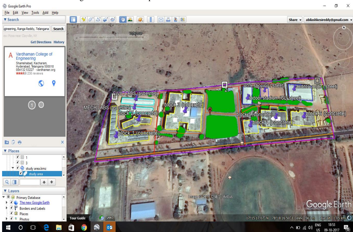
Figure 2. Different Types of Rooftops and Road Network digitized using Google Earth Pro

resulted in digitized buildings with of 6 concrete roofs, 2 Asbestos rooftops, and 3 GI roofs of the study area that have been saved as KMZ (Keyhole Markup language Zipped) and represented in Figure 2 respectively.