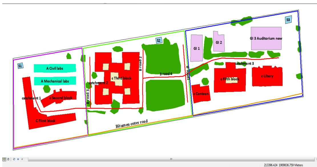
Figure 5. Rainwater harvesting sites/storage tank locations

Considering the elevation, slope and drainage pattern and from the observed runoff of each catchment, rainwater harvesting sites/storage tank locations are identified, located and shown as S1, S2, and S3 at respective catchments in Figure 5.