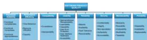
Fig 2. ISO/IEC 25010 Model

The instruments use for collecting relevant data from the target participants include survey questionnaires consisting of pre and post survey, and interview guide questions. Post survey questions were based from the ISO/IEC 25010 to have a valid justification on the quality of the web-based application. The figure below illustrates the