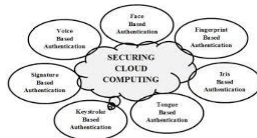
Figure 1 Biometric Techniques to Secure Cloud Computing

For ensuring security to cloud, In general secure word is used for verification. And easily attackable. we can use bio-metric verification to provide security in cloud as in the Fig. 1