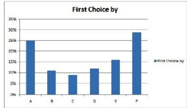
Fig 1: First factor that affect the online trust

Q2: Do they consider following parameters to decide the trust on review?