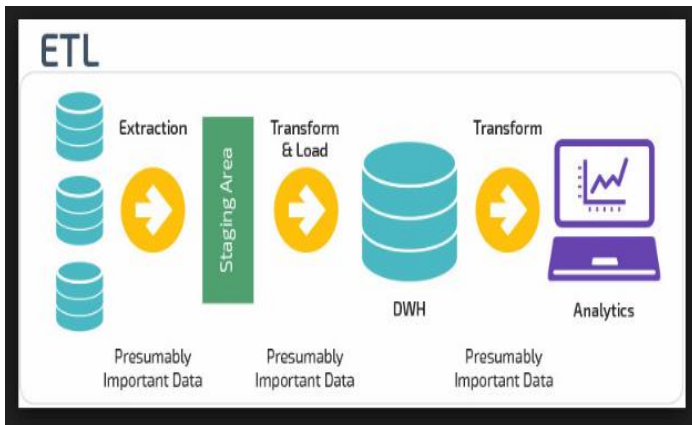
Fig 2: This contains basically 3 layers or areas our data quality will depend upon and checked