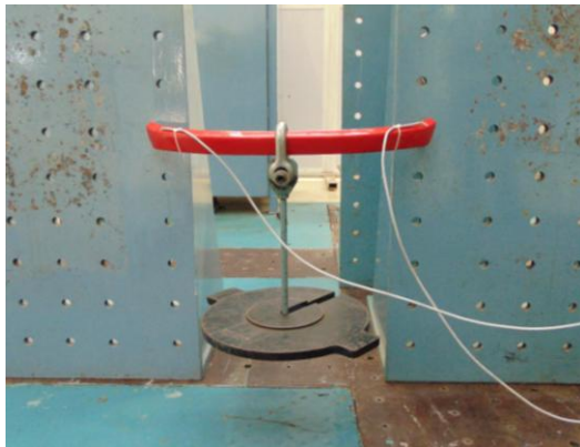
Figure 1. Experimental Setup

Load type – Vertical loading Dead mass of hood - 20kg Vertical Loading - 3g = 3x20 =60kg. Final load considered for FE analysis - 70 kg (max)