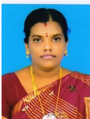
Image Registration, Software Engineering, Biometric, Computer Networks. She has published over 30 papers in refereed journals and conference proceedings. She is a member of the Advisory Committee Sri Changara College, Kodaikanal and Doctorial Committee at Gandhigram Rural Institute, Gandhigram. She is also a lifemember of CSI.