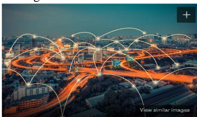
Fig. 1: System Components

This Section presents the various modules of our system. Overall, the system has 5 main method elements ( refer figure 1) via – knowledge extraction, tweets pre-processing, data processing, knowledge benchmarking and knowledge image as represented in figure one.