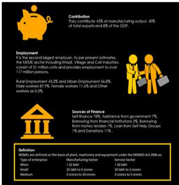
Source: Make in India MSME sector Achievement Report 2017

MSME units in the country are close to 51 million employing 117 million people which is 40% of the total work force. According to ICSB (International Council of Small Business), formal and informal MSMEs make up over 90% of all firms, accounting an average of 60-70% of overall employment and 50% of GDP (Gross Domestic Product). In rural areas, the main income provider is MSME [6].