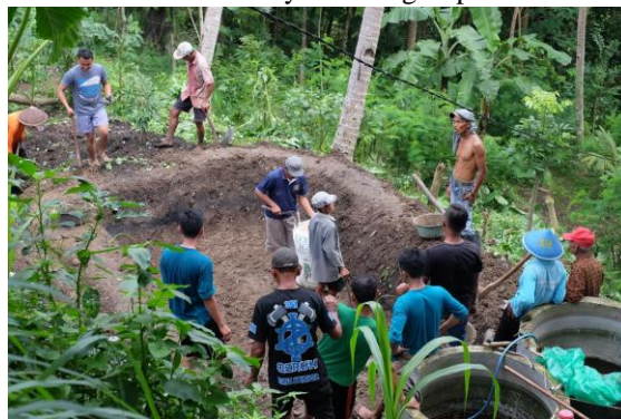
Fig. 2. Catfish Culture Program

Since the construction of fish pond took quite a long time, the time to make the pond was made early at 7:00 in the morning. The size of the pond was 4x3 square meters. The depth was one meter. All farmer groups participated in the program. The tool for digging was a hoe. The activity finished at 09.00 a.m. The substances contained in the tarpaulin must be removed first before the fish seeds were dispersed in the water. The pond filled with water needs to let sit for 1-2 weeks to neutralize it. The catfish seeds dispersed were 1.000 obtained from the Community Service group 60.