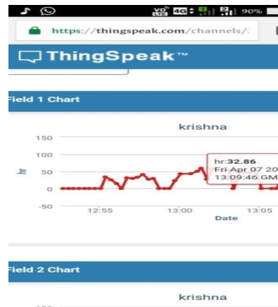
Fig 3. Fetal heart rate

Our three-dimensional approach towards this battery operated wearable device and service that we offer is about delivering excellence to our rural women's, safeguarding the environment and ensuring that it doesn't cause any health impacts to the expectant women and her fetal. The main purpose of developing a versatile, cost effective and efficient smart health monitoring system, has been successfully realized at the end of the design process. The entire system is an integration of hardware, software implementations. The pregnant women are advised the tie the wearable module across their womb and the sensors immediately captured the information and same were displayed. This is helping the expectant mother to know about her fetal condition. Also we have guided the pregnant women about the wearing position, how to discriminate between normal and abnormal readings etc., The system designed and developed was tested for various woman and the system has produced expected results.