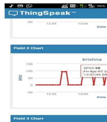
Fig 4 PPG sensor value

Fig 3 shows the Fetal heart rate for certain time interval and Fig 4 shows the saturation level of oxygen of the pregnant woman, both are shown in the physician mobile using Thingspeak, web computing host so that the data is available in the cloud.