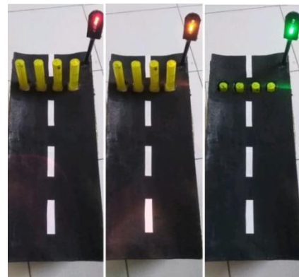
Fig 3. Output screenshot