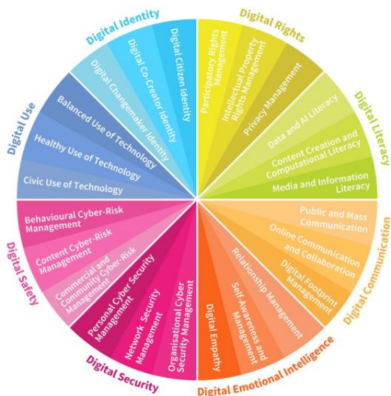
Figure 3. 2019 Digital Intelligence (DQ) Framework[17]

The review of Internet sources shows that there is a demand to measure DQ (Digital Quotient) as a universal indicator of the level of digitization of society. Digital Quotient (DQ) is a set of technical, cognitive, metacognitive, social and emotional competences based on universal moral values, which help people to face the problems of digital life and adopt to its requirements [17]. Digital Quotient is represented by three levels: digital citizenship (the use of digital technologies to communicate with other people in everyday life); digital creativity that includes the creation of media products and apps; digital enterprise that is oriented on the use of digital technologies in a professional activity. The structure of DQ was created by professor Yuhyun Park, in 2019 it was updated in cooperation with Educational Framework Programme OECD up to 2030 and was top-ranked as the standard of digital competence (Fig.3). The goal of our further perspective is the creation of a universal test based on the structure of DQ that allows objective monitoring of the phenomenon under investigation with further possibility of content adjustment according to new digital tendencies.