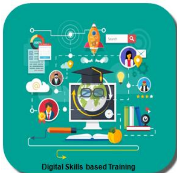
Figure 1: Internet usage for education

the public extensively look at online options as increasingly attractive .