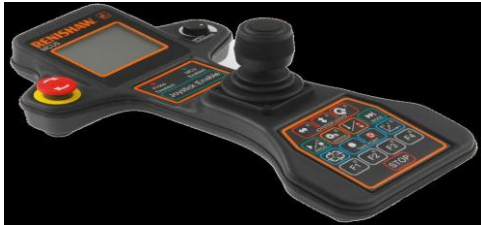
Fig. 4.MCU5 Joystick .