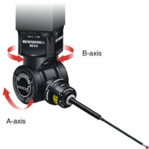
Fig. 2. Probe head .

REVO2 is the only scan system for CMMs that simultaneously checks the movement of three machines and two head axes while collecting data from the workpiece using its 2D and 3D range of tactile samples, surface measurement sensor, and now contactless. Vision probe too. The head's design incorporates sophisticated laser measurement and electrical signal transmission technology for precise work piece measurement at extremely high rates of data capture. The 5-axis control system prevents unnecessary machine movement dynamic errors as most testing is done by the measuring eye. Because the head is much lightweight and flexible than the CMM, changes in the component structure can be followed quickly. without introducing large dynamic errors. The REVO-2 multi-sensor system is managed by the I++ DME compliant UCC server interface. Probe head show in the figure 3.