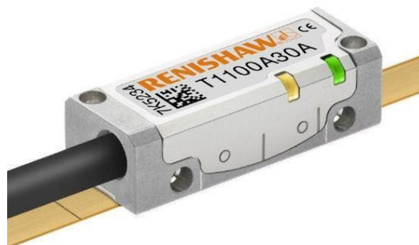
Fig. 3. Encoder .

The effect is a low SDE, resulting in better regulation of velocity for enhanced scan strength and position stability. A detachable analog or digital interface is also available in the form of a powerful, compact connector that is up to 10 m from the readhead. The software supports 1 nm digital interpolation of clocked inputs for maximum performance speed performance at all resolutions for industry-standard controllers. The encoder is shown in the figure 4.