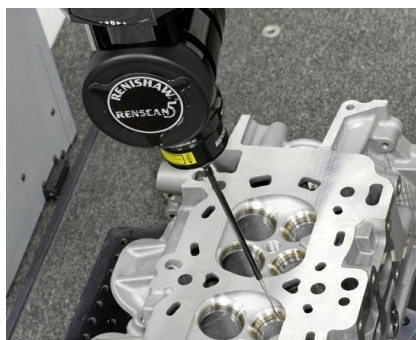
Fig. 7. Probe head during calibration .

The measurements 12 valve seats 36 scans on valve guides (3 per guide), Figure 8 shows the Probe head during calibration and figure 9 shows the comparison chart.