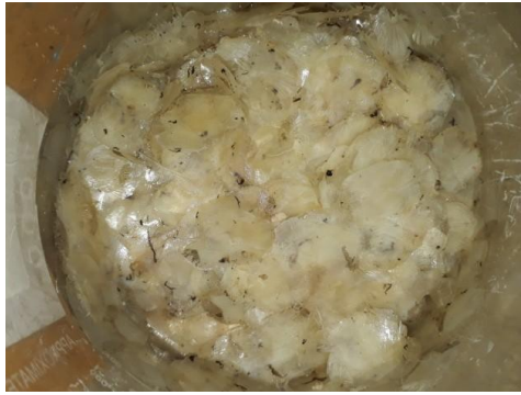
Fig. 2. Collected Fish Scales