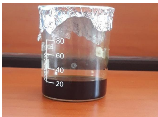
Fig. 9. Collagen

Neem extract has been prepared by the above mentioned procedure, the neem extract were prepared, now this work was extended by the addition of neem extract with the collagen extracted from the fish scales (Figure 9).