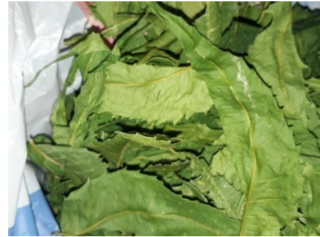
Fig. 5. Shade Dried Neem Leaves

The insoluble parts are filtered out. NaCl is added further to the filtrate to the ultimate concentration of 0.9M and kept uninterrupted for 24 hours. The suspensions are centrifuged at 8000 rpm for 1 hour and resolubilized with 0.5M acetic acid and they are subjected to centrifugation. This process repeated for better result. Then the final solution is dialyzed by means of the dialysis membrane against 0.1M acetic acid and the distilled water for 24 hours. Finally, the solution is subjected to freeze dryer to acquire the final product as collagen.