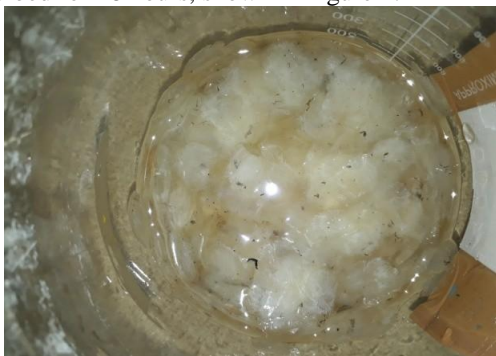
Fig. 4. Treated with Acidic Solution

After surveillance, remove the solvent substance and washed with the distilled water, then swap 0.05M EDTA to demineralise the fish scales and kept untouched for 48 hours, shown in Figure 3. After observation, the demineralised fish scales were treated with the 0.5M acetic acid and kept undisturbed for 48 hours, shown in Figure 4.