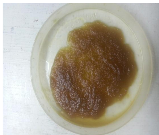
Fig.12.Collagen Sponge with Neem Extract

Prepared collagen sponge is depicted in Figure 11 and Figure 12 shows obtained collagen sponge with neem extract. As per the survey analysis taken from the doctors, patients and pharmacist who resident in Madurai, changing wound dressings regularly or periodically may cause pain, irritation or any sort of discomfort will be felt by patients. They needs around 30-45 minutes for a simple wound dressing in most of the cases. Particularly patients feel difficulty when they are suffered from large wounds such as extensive burns, foot ulcers, pressure ulcers etc. To overcome this problems, the proposed work was proceeded successfully by prepared the collagen sponges with the addition of neem extract which increases the tissue in growth, speed of recovery, cell migration and the anti-bacterial efficacy. Also, this sponge will be cost effective.