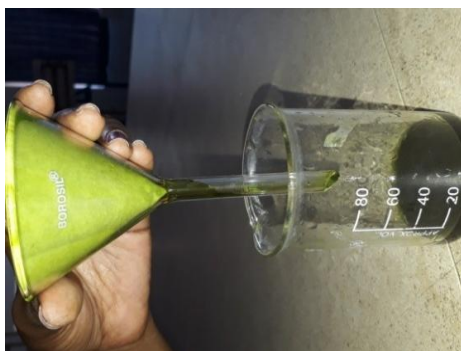
Fig. 8. Filtration