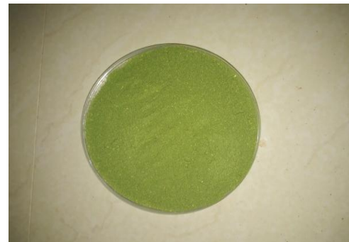
Fig. 6. Powdered Neem Leaves