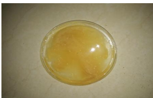
Fig.10. Neem Extract

Obtained neem extract has been shown in Figure 10. The collagen is extracted from the fish scales by the above mentioned methods. Now this collagen is treated with acidic solution and freeze at -80^{\circ}\text{C} and then freeze dried the collagen which produces the collagen as a spongy structure. This proposed work was conducted to compare the speed of recovery between the collagen sponge and the collagen sponges with the neem extract. This work has been initiated with the hope that addition of neem extract is an innovative work and also they are easily available to everyone.