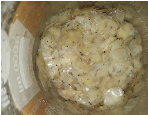
Fig. 3. Demineralised Fish Scales

After surveillance, remove the solvent substance and washed with the distilled water, then swap 0.05M EDTA to demineralise the fish scales and kept untouched for 48 hours, shown in Figure 3. After observation, the demineralised fish scales were treated with the 0.5M acetic acid and kept undisturbed for 48 hours, shown in Figure 4.