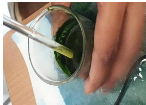
Fig. 7. Mixed with Methanol