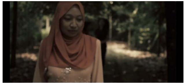
Fig. 2. Screenshot of the ending scene; Two blurred people were running towards the Princess in an unknown forest