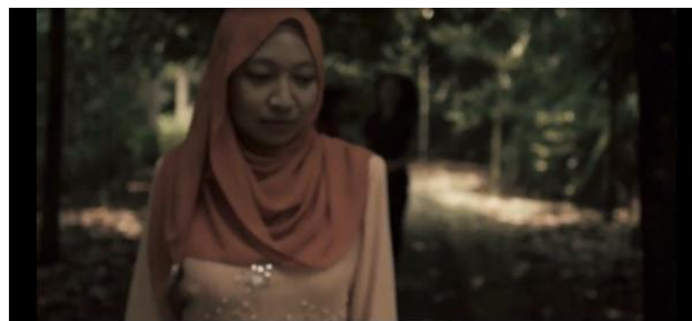
Fig. 2. Screenshot of the ending scene; Two blurred people were running towards the Princess in an unknown forest