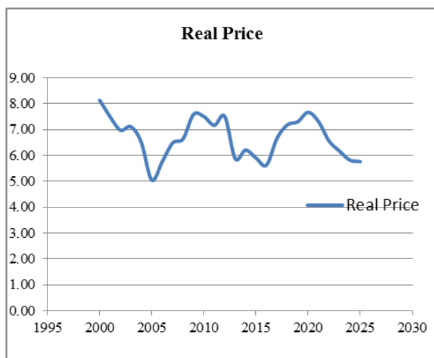
Fig-3: Observed and forecasted values of Real Price of Green leaf in Assam (From 2000 to 2025)