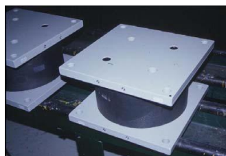
a) Elastomeric bearing

Base isolation has made it possible to medium rise masonry or concrete