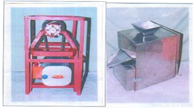
Fig. 1. Right photo shows the Funnel and Metal Case Assembly made of stainless steel. Left shows the mounting of the Motor & Extrusion Assembly.

The construction of the machine has five (5) major parts as shown in Figure 1 namely: stand assembly, extrusion assembly, guide plate and cutter assembly, motor assembly and funnel case assembly.