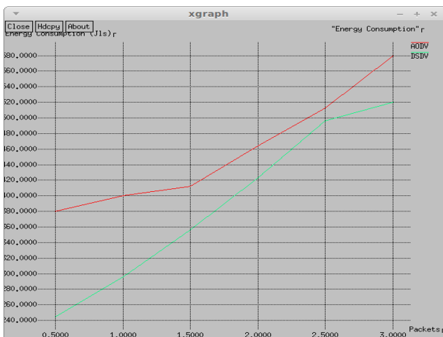
Fig. 1. Energy Consumption graph