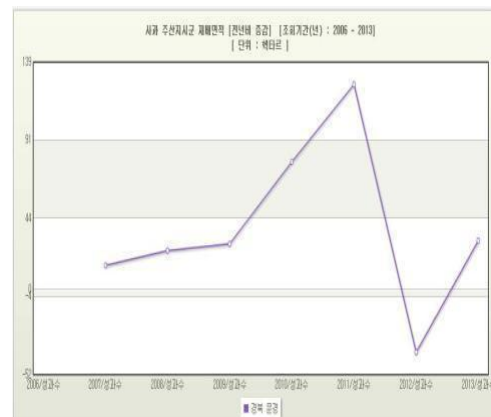
Figure 3. A Year-on-Year Increase in Apple Acreage