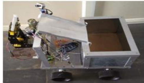
Top view of cotton picking robot using arduino