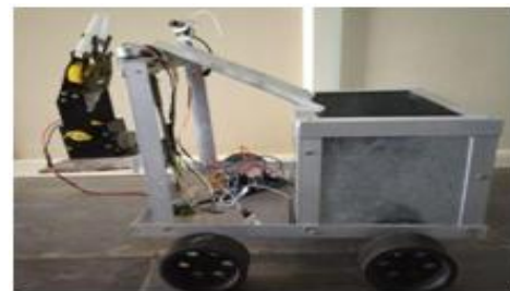
Side view of cotton picking robot using arduino

The above robot works based on arduino and can be operated with the help of a Bluetooth module. The person operating the robot has complete control over it. He can make it move forward, backward and sideways and can pick cotton with the help of the camera mounted on it and the robotic arm, whose height can be adjusted as and when required. The cotton boll is picked by the robotic arm by opening and closing it and that cotton boll is put into the collecting box, which is attached behind the robot. The collecting box is made empty when it is full