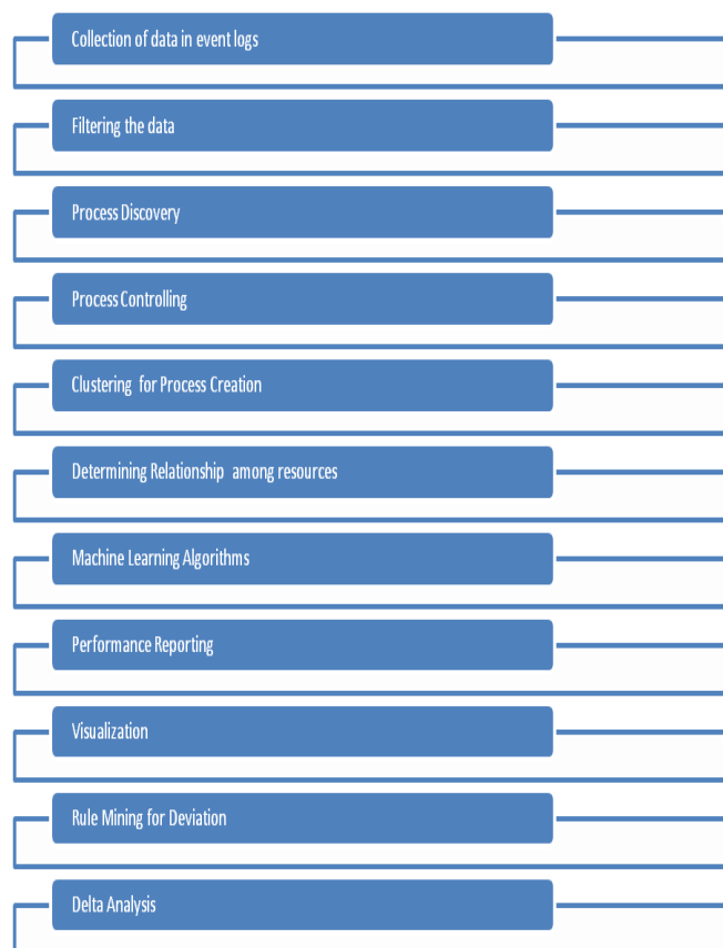
(Figure 1: Common Framework Activities for Process Mining based Software)

Every Process Mining software contains common framework activities. The most widely recognized activities of process mining framework for software are portrayed in following figure.