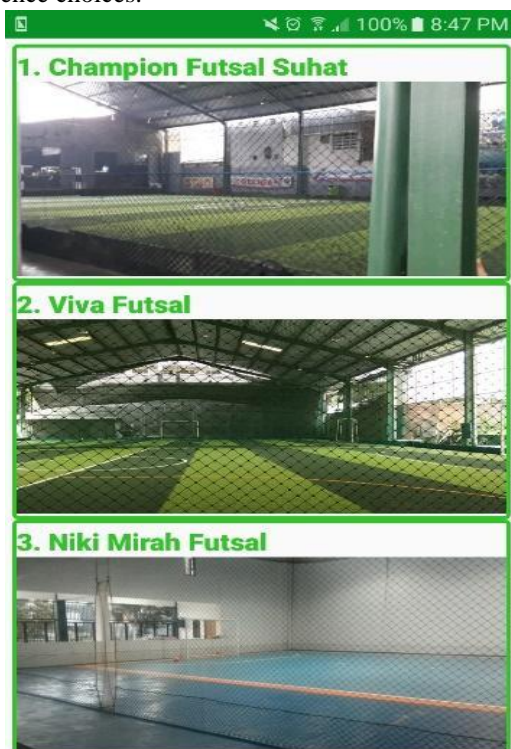
Fig. 3 Recommendation Page

Testing the recommendation system was based on correlation testing to see the correlation between the recommendations built by the system compared to the user's preference choices.