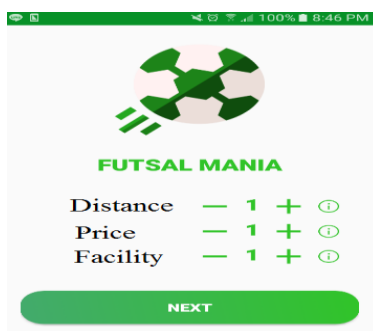
Fig. 2 Main Page

Fig. 2 is the main page of the application. On this page the user is inquired to enter the weights for each criterion. Then the user gets a recommendation for a futsal court recommendation according to the user's current location as in Fig. 3. If the user wants detailed information about the desired futsal location, the user can click on one of the futsal places and then the detail page will be appear.