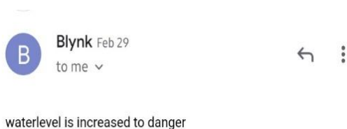
Figure 4. Notification received

The Figures 3 & 4 depicts the result regarding the safety of the bridge and henceforth helps us to monitor and maintain the condition of the bridges in the Water Bodies and to prevent the public in the bridge at the emergency situations