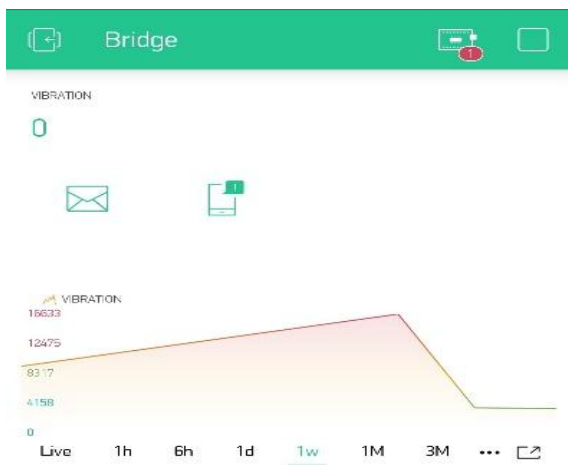
Figure 3. Bridge details been detected