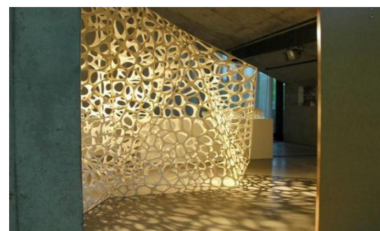
Fig. 3.Decorative partition. Generative Form Lighting Design [8].

The play of light and shadow in the product shape segments is applicable in light design (Fig. 3).