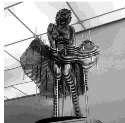
Fig. 2.Metal sculpture Monro [4].

Associated with generative design in visual perception, bionic and parametric design are inspired by nature and math.