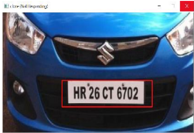
Fig. 4: Vehicle Number Plate Detection

Vehicle number plate detection is performed by the various algorithm. But some the algorithms have achieved good accuracy. For instance, Convolutional Neural network used for classification of number plate has shown good results. The purpose of classification is used to identify whether the image consists of number plate or not. If the image consists of number plate then it will be detected from image and Number will be extracted from the detected plate using morphological process.