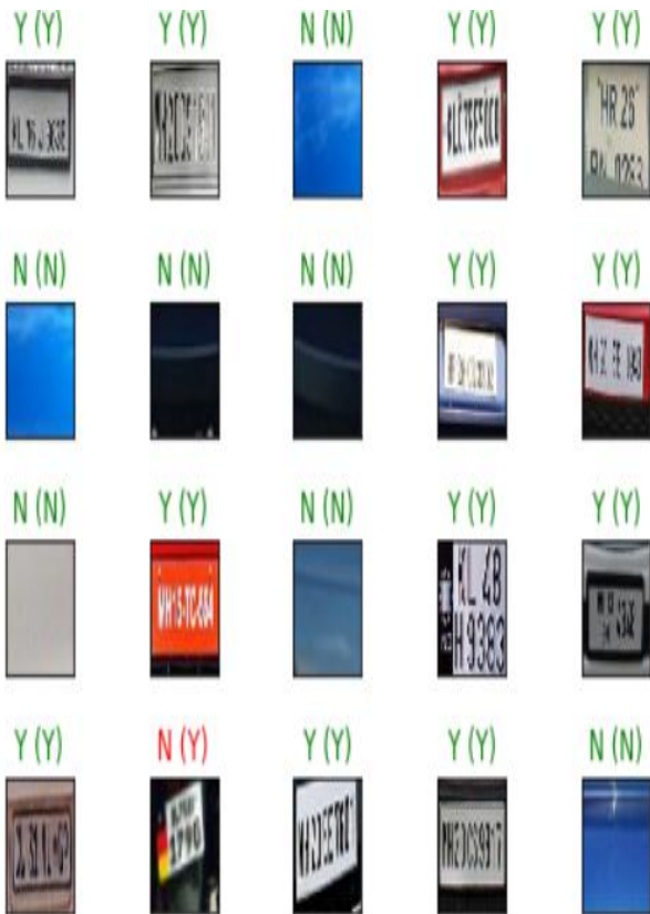
Fig. 3: Vehicle Number Plate classification using neural network