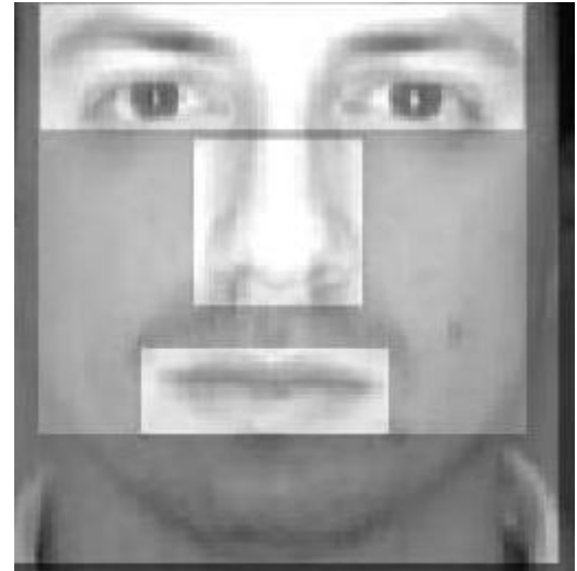
Fig 3.2: Face Recognition using Template matching

Face detection is taken input the photographs from digicam and output saved in region area and measurement of faces. The output of the face detection gadget can be a face recognition data, face monitoring, face authentication, face ex-press focus, and facial gesture recognition device. If the facial image with its frame measurement and place of frame, illumination or orientation can be normalized to continue face detection.