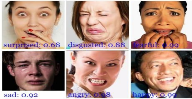
Fig 5.1: Classification of Expression

The device automatically acquired the college/school of students in the classroom whilst lecture taking a class. This approach used to locate the pupil mentally in the classroom