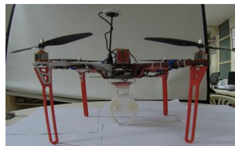
Fig 4-UAV installed with Two-Jaw Custom Gripper

It consists of Naza M Lite Flight Controller, 5000 mAh Li-Po Battery, F450 Carbon Fiber Frame, Raspberry Pi 3B+ & Pi Cam, and custom-designed gripper mechanism which helps UAV to sustain an average flight time of 12 min, and 200-250 gm of payload (depending upon wind conditions). The purpose of UAV is to collaborate with ground AGV units and to provide AGVs with the surveillance data which UAV has collected, to detect the enemy location precisely. UAV is also used to carry explosives and can also collect small items from hazardous areas rapidly [12].