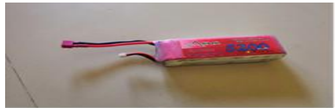
Figure 2: Li-Po Battery (5200 mAh)

Lithium Batteries are preferred here as, with higher discharge rate and high weight vs stored energy ratio, they can be utilized for the task substantially. The issue with its charging is crucial and cannot be ignored.