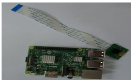
Figure 1: Raspberry Pi 3+ model with Pi camera

The Raspberry Pi-camera is a standard-issue camera that will be capturing high-definition video at 1920*1080 resolution to provide enough convenience for typical usage on the UAV. The camera uses its own dedicated CSI Interface, designed especially for camera interfacing.