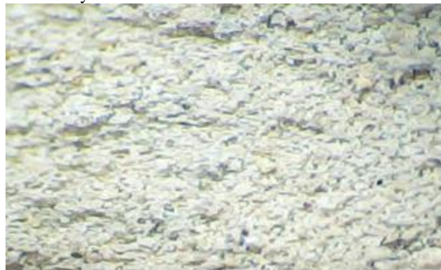
Figure 1. Bentonite clay of the North Jamansay deposits in the form of clay powder x600

The microstructure of the samples and the morphology of the crystalline phases of samples of bentonite clays of the North-Jamansay deposit were carried out on a MBS-10 laboratory optical microscope with a digital camera installed up to x600 magnification (Figure 1). Microscopic studies mainly revealed alkaline and alkaline-earth montmorillonites in the form of aggregated particles of a smaller size, as well as in the form of lumpy aggregates. The presence of amorphous silica is also observed in the form of particles of carbonates and dolomites in the form of white spots. Also found were large, wiry inclusions of iron and quartz compounds, as well as plaster inclusions in the form of crystals of two-water gypsum, which are evenly distributed in the test samples under study.