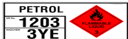
Fig. 3: TREM card in petrol tanker