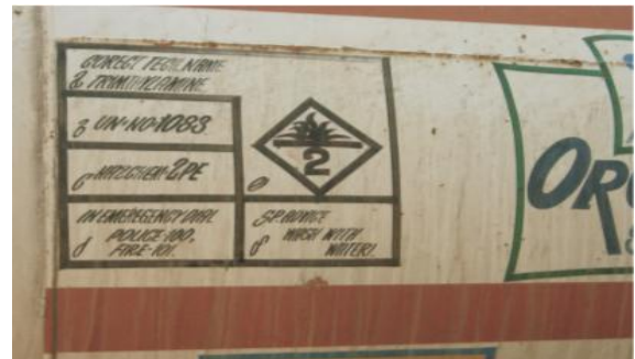
Fig. 2: TREM card painted in tanker