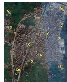
Fig. 2. Distribution of 16 Ground Control Points (GCPs)