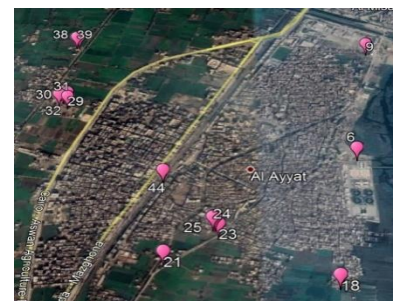
Fig. 3. Distribution of 14 Check Points (CHKs)

Second study case, using the same set (used in the first study case) of 16 Ground Control Points (GCPs) to correct the image, and using the same set (used in the first study case) of 14 Check Points (CHKs) to evaluate the accuracy. Coordinates of (GCPs) were captured using Web Map Service (WMS) server (Google Earth), while coordinates of (CHKs) were captured by field GPS campaign.