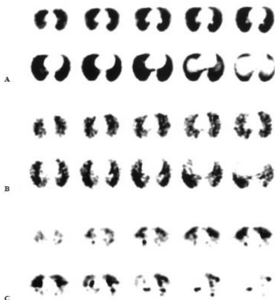
Fig.2. A: 45 year old healthy subject with fractal dimension 0.46. B: 65 year old male patient having mild

A strong association was observed in between the total lung volume and pulmonary function tests results [47]. From this review, three-dimensional CT densitometry shows significant ( p < 0.001 & r = 0.97 ) outcomes in contrast to all existing methods as shown in table 2. Overall, three-dimensional CT densitometry is the better method to grade the emphysema from moderate to very severe only. Still further research work needs to be done for detection of emphysema during mild stage. After examining all the existing studies, it has been obtained that more research is needed to detect emphysema during its mild stage.