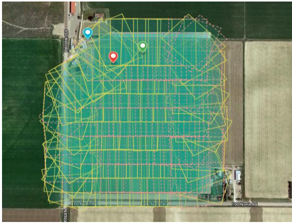
Fig. 3. Drone during time of flight taking images at specified intervals