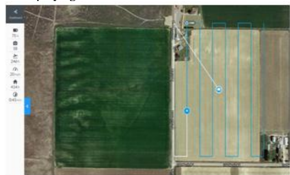
Fig.2. Drone plane of flight at bounded area for surveillance

After interfacing the drone with the selected coordinates of the field, software enable start option, then drone reaches the start position of the plan for operation. It starts taking the pictures in regular intervals of time during its time of flight and the picture accuracy depends on the plan of flight and the altitude of the flight. So, those factors needed to be checked before deploying the drone.